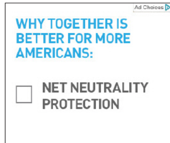
Box and type rise from below.