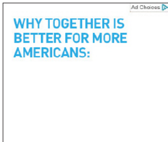
Type builds in

The following is an online advertisement of Comcast: