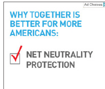
Checkmark animates on.