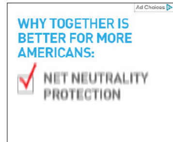
Type and box move up.